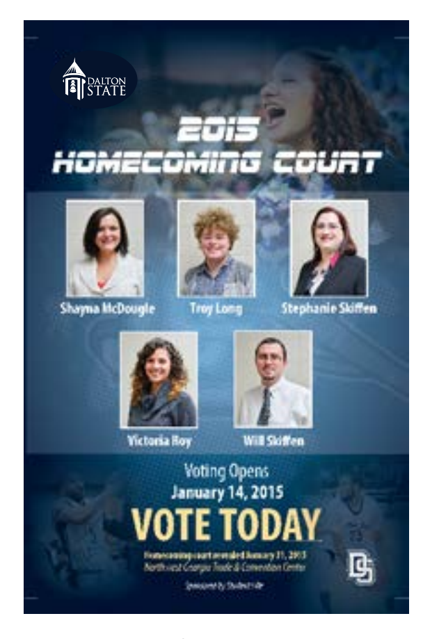
Notice the use of the Dalton State bell tower logo on a high contrast background. The Athletics "DS" logo is also being used as a subbrand and not in place of the primary bell tower logo.