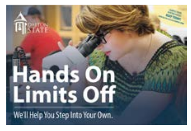
Notice the use of the Dalton State bell tower logo on a high contrast background.