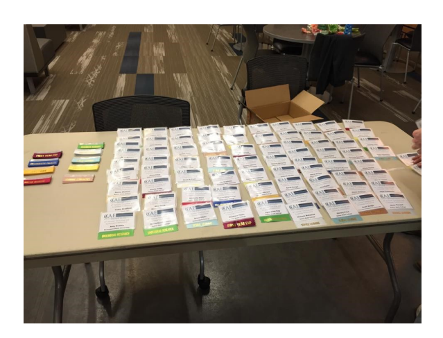
Ready to go!