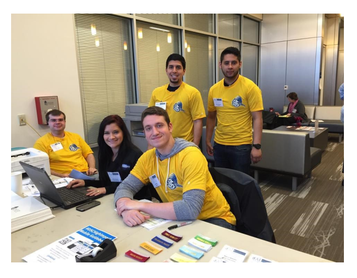
Our friendly, faithful student interns!